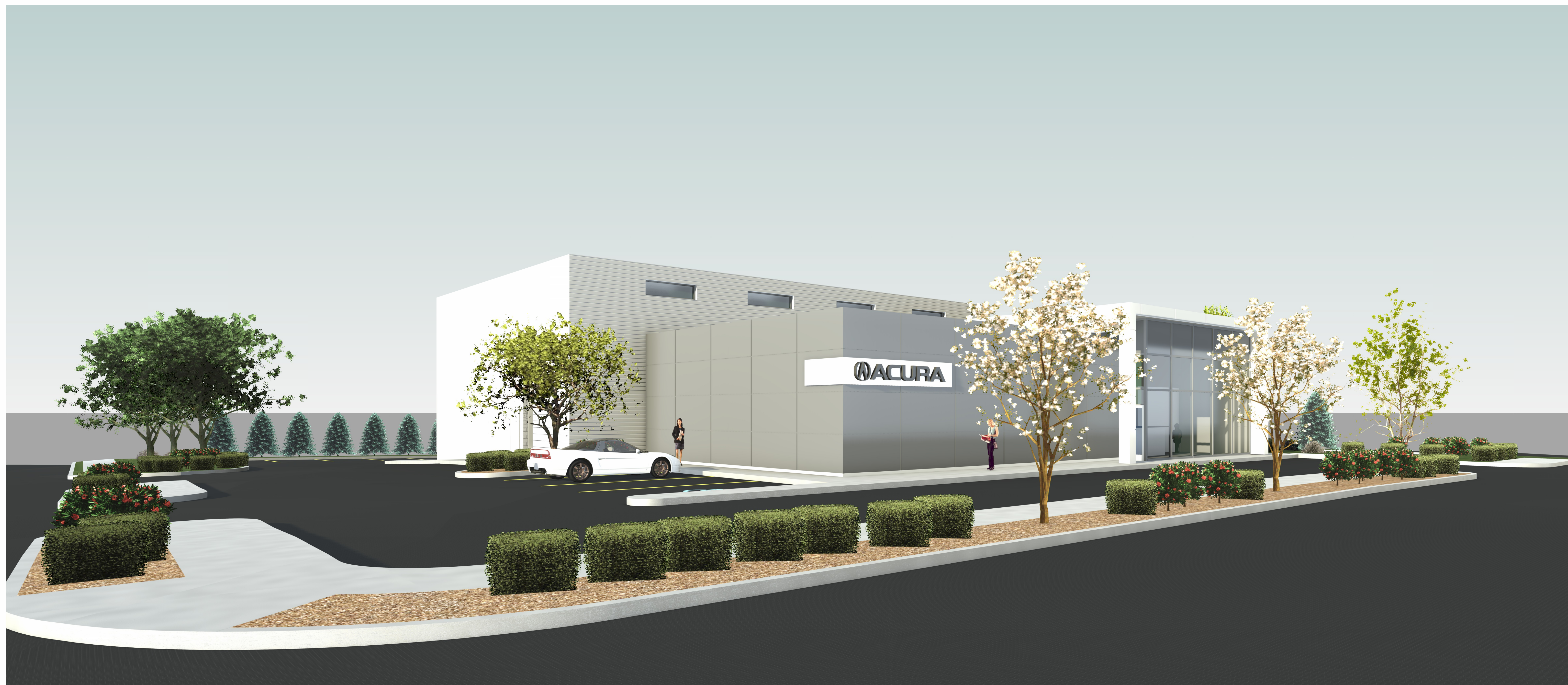
① VIEW AT INTERSECTION