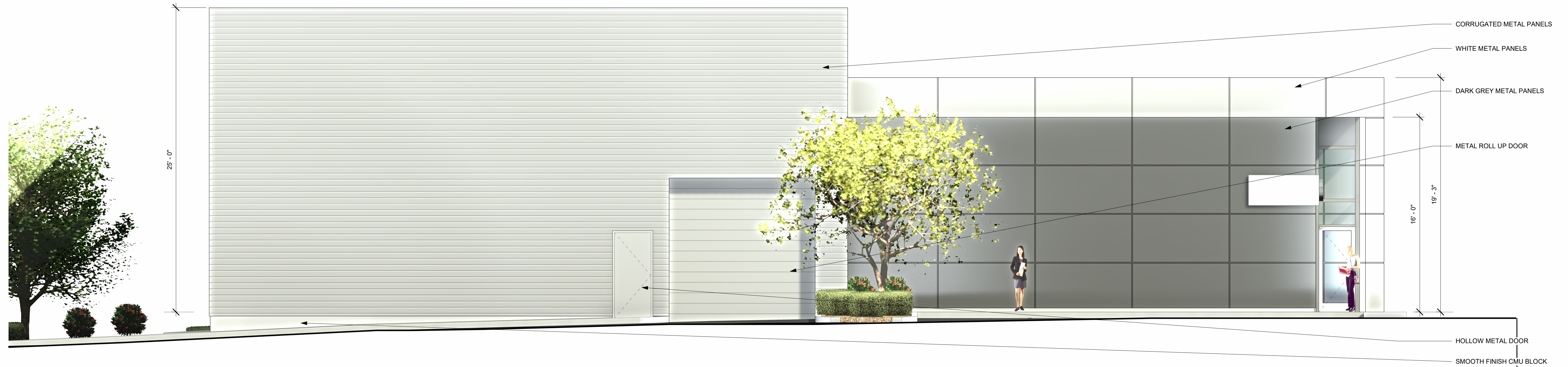
① LINDEN AVE (LEFT SIDE) ELEVATION 1/4" = 1'-0"