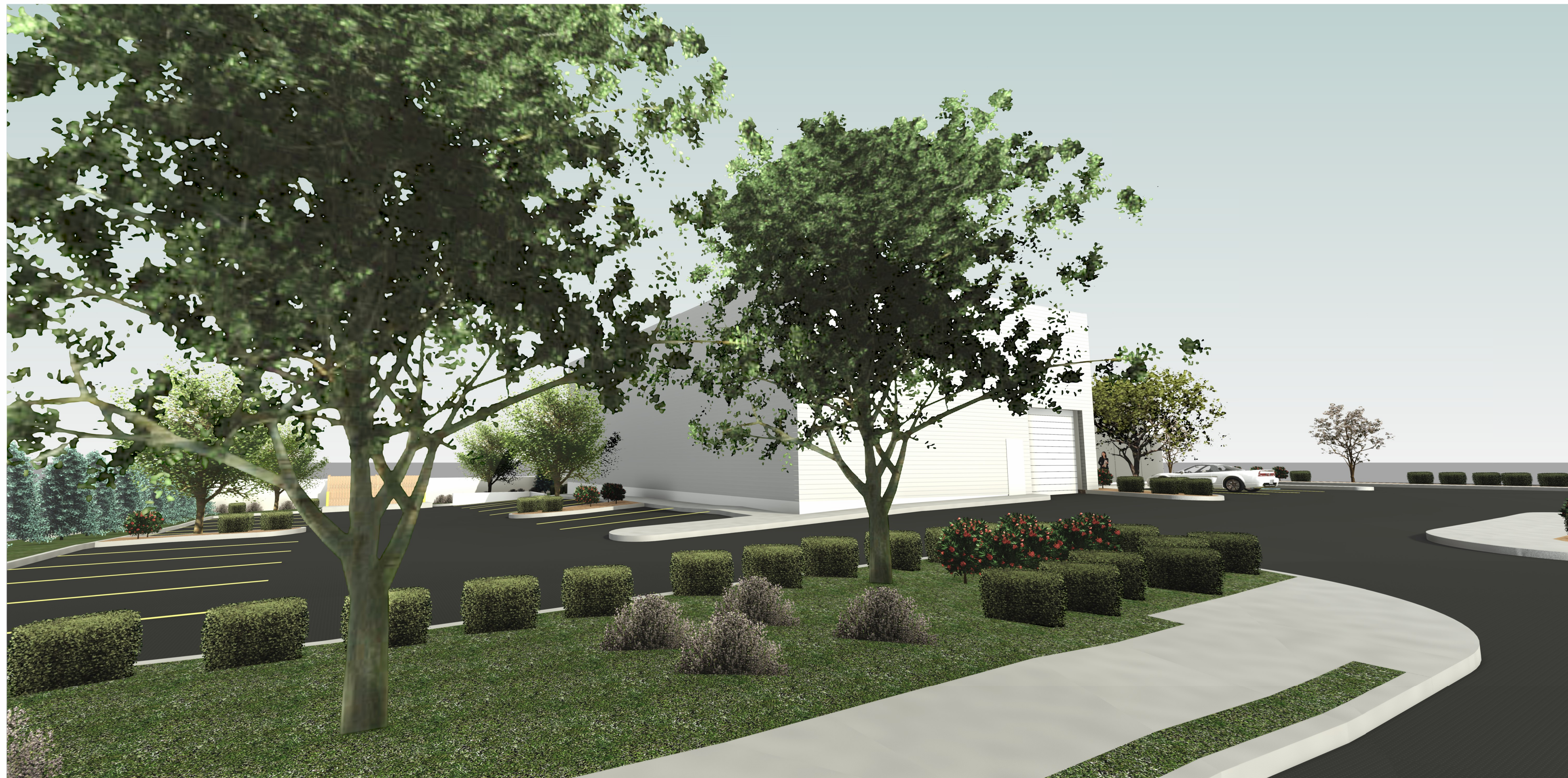
① VIEW FROM N. LINDEN AVE.