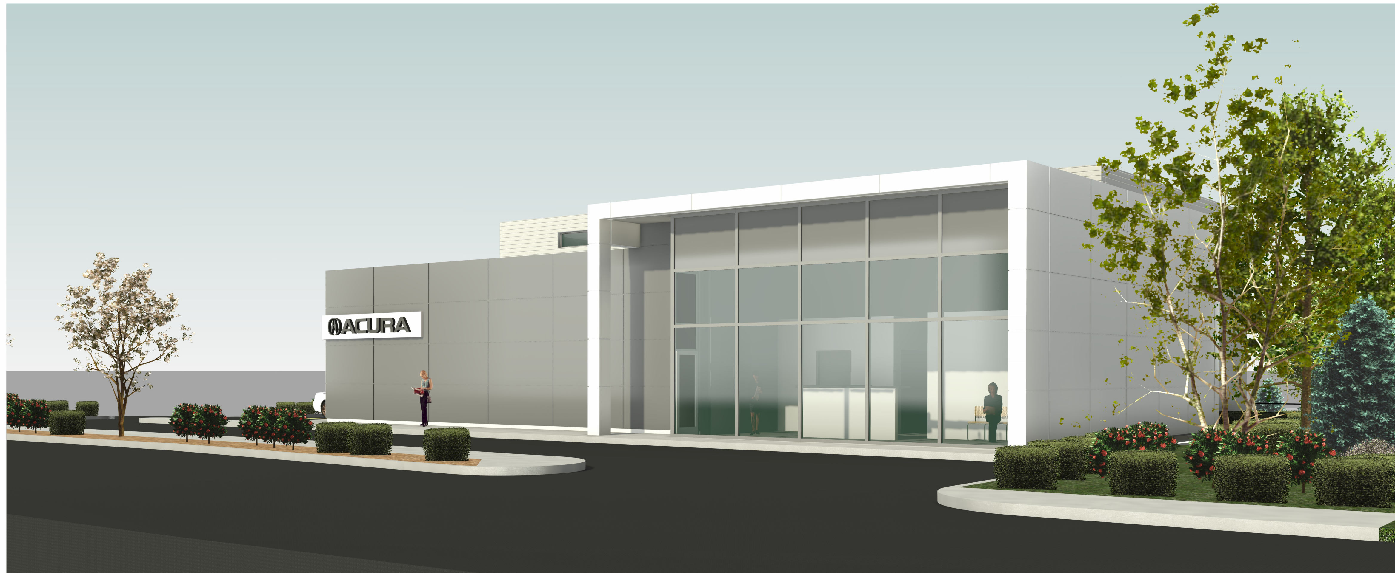
② VIEW FROM WEST ST.